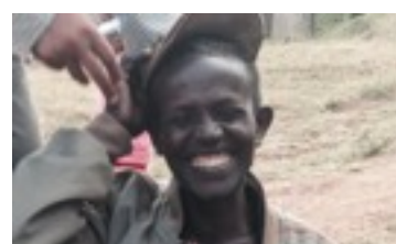
A NEW PATIENT SIGNED UP BY APA