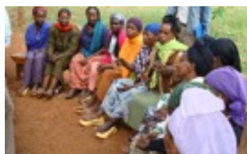
MICROFINANCE RECIPIENTS RETURNING THE LOAN